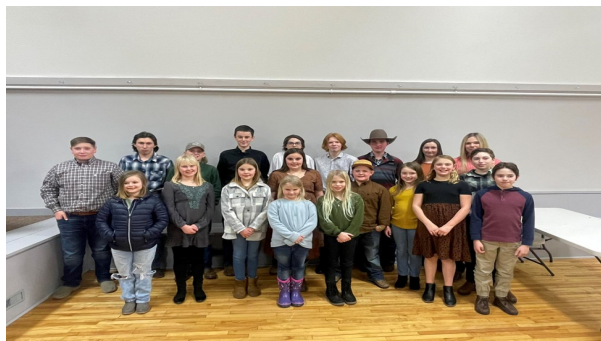
Photo - Public Speaking event held in Minburn February 10, 2023.